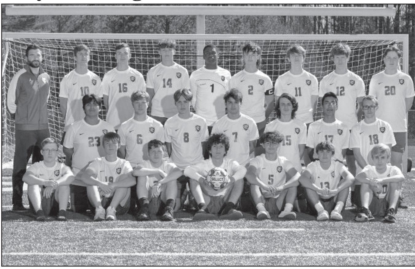
The Towns County men's soccer team has high hopes for 2022 following last year's postseason success.

"Tonight, we tried a few different formation and personnel packages, and it worked out in our favor. We are continuing to improve on communication with some